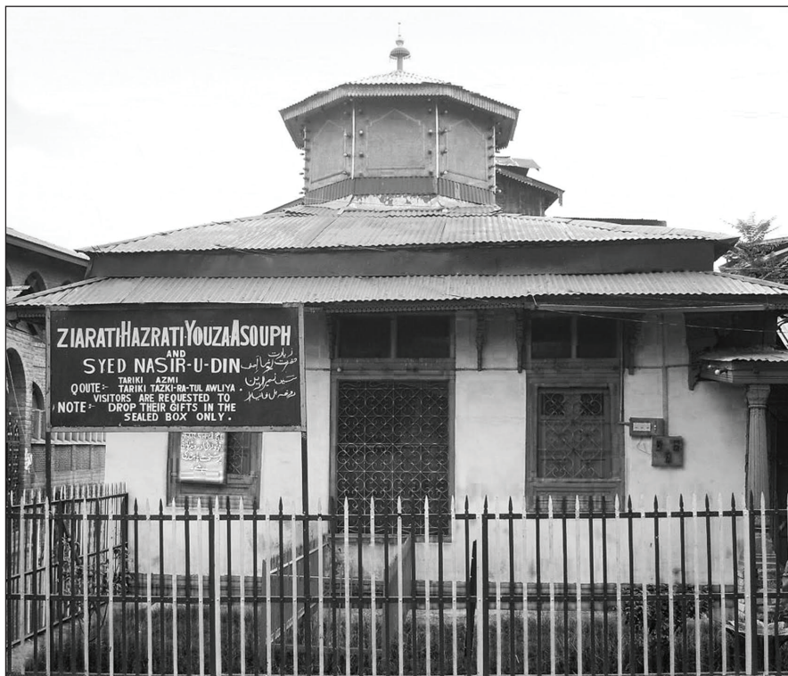
The Tomb of Jesus— Khanyar Street, Srinagar, Kashmir